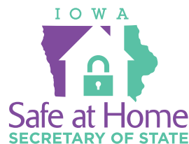
Paul D. Pate Iowa Secretary of State